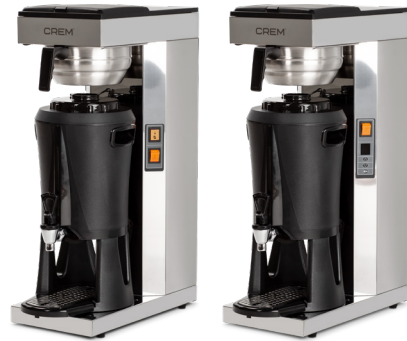
Mega Gold M